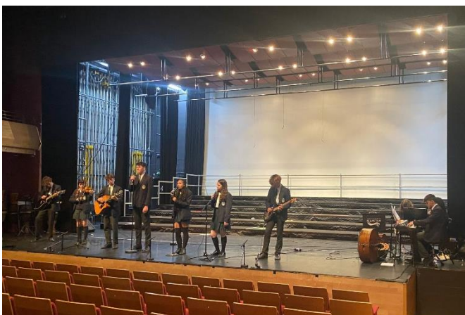
The Rock Band in rehearsal at The Barnet Music Festival

Our musicians have shone once more in The Barnet Music Festival this week, a celebration of the incredible musical prowess that resides within our community. In our 10th appearance, since the school has opened its doors, the school Rock Band showcased their raw talent and passion.