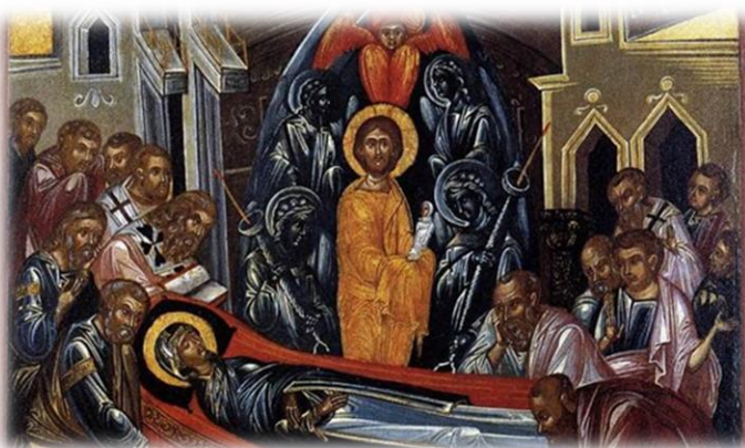
Icon depicting the Dormition of the Virgin Mary, 16th Century.

This week as we look ahead to the summer break, we also remember one of the other holy feast days of the Orthodox Church, celebrated at the height of summer. August 15 is an annual bank holiday not only in Greece /Cyprus, but in most Catholic and Orthodox Christian countries around the world.