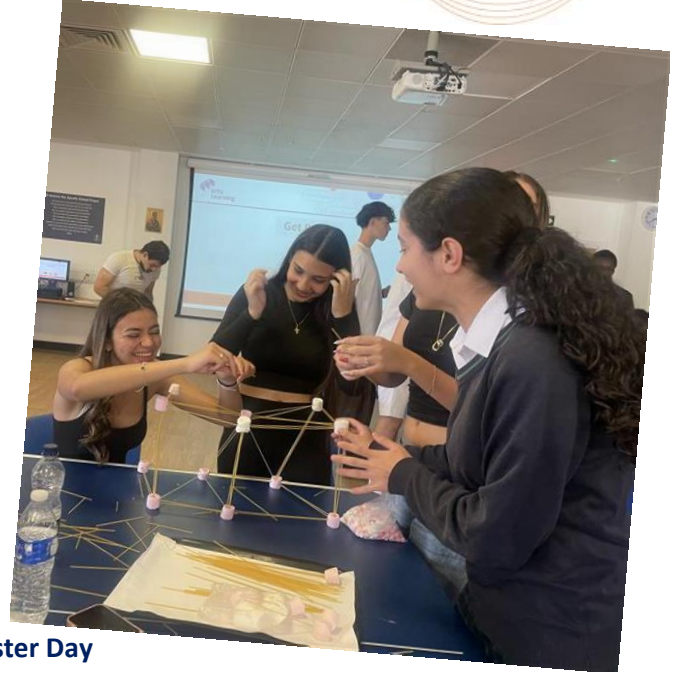
Year 10 Sixth Form Taster Day

Well done to all our Year 10 students who took part in the Sixth Form Taster Day on Thursday. They had the chance to experience a range of A Level lessons, where many showed great focus, curiosity, and the ability to apply their existing knowledge in new ways. The day also included a creative and fun team challenge using marshmallows and spaghetti, where students worked together to build the tallest and strongest structure they could. It was a great opportunity to see problem-solving, communication, and teamwork in action.