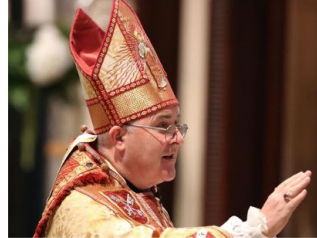
Archbishop (A leader of the Christian church)

Download the Studybugs app for reporting your child's absence.