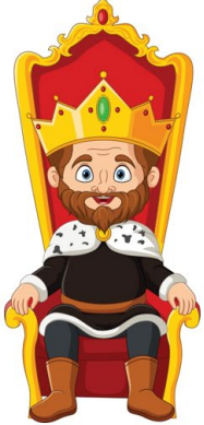
Monarch (a single ruler)