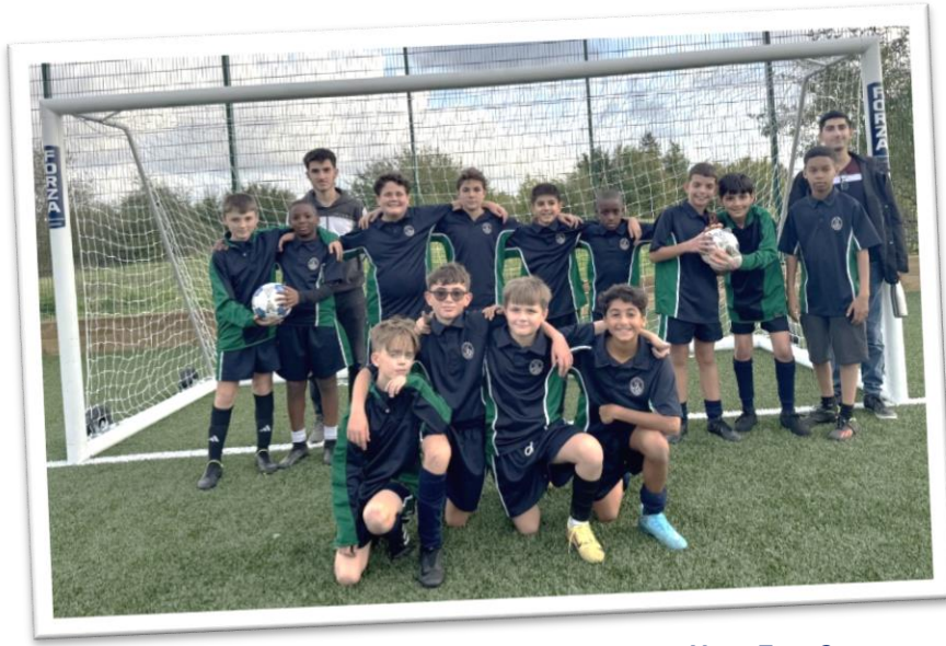
Year 7 vs Compton