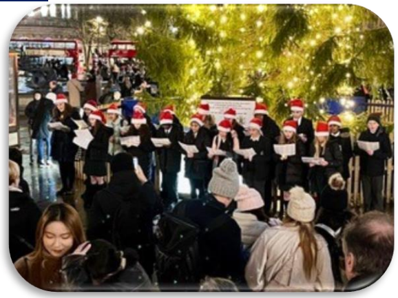
Harmonising for a Cause: Our Choir's Heartfelt Performance at Trafalgar Square

In the heart of London's iconic Trafalgar Square, the spirit of giving and festive joy reached new heights as our school's 20-member choir took center stage for a special performance. With a dual purpose of raising funds for Noah's Ark Hospice and spreading the Christmas spirit to the hundreds gathered, the event was a resounding success that resonated with warmth, harmony, and a sense of community.